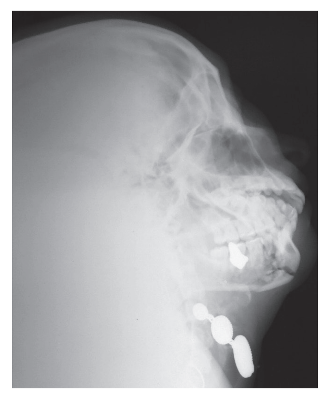
Image 5: Radiograph of decedent's skull showing second bullet point of lodgment.

or stippling of the adjacent skin was identified at the entrance wound. The decedent had thick black hair and was not wearing a hat. There was grossly visible fouling of the outer table of the skull and dura described in the autopsy report, but this was not photographed. The inwardly beveled oval entrance defect in the skull had radiating fractures to the right posterior cranial fossa and the bullet track completely transected the pontomedullary junction. A radiograph of the skull showing where the bullet lodged is shown in Image 5 and an autopsy photo with a rod depicting the trajectory through the base of the brain is shown in Image 6 .