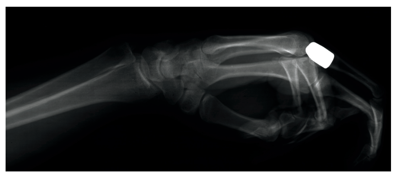
Image 3: Radiograph of the decedent's left hand with the bullet lodged in the base of the left ring finger at the metacarpal-phalangeal joint.