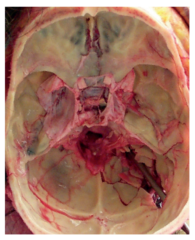
Image 6: Trajectory rod depicting the second bullet's course through base of skull.

The gunshot wound trajectory through the chin and shoulder must have occurred first because the victim would have had to have been upright at the time the first shot was fired due to the distant range of fire combined with her body position: the shooter and the victim were both witnessed to be standing prior to the shots being fired and the projectile from the first gun-