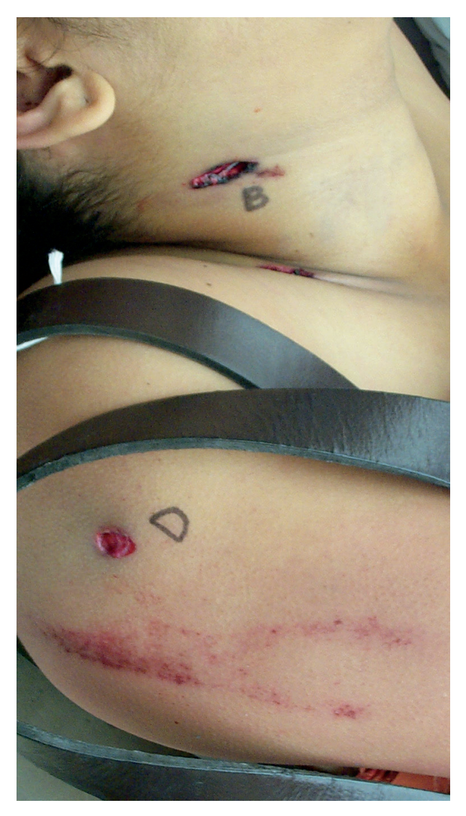
Image 2: Close-up of right shoulder contusion, indicating that it corresponds in size to the strap of her handbag.

A second gunshot wound trajectory entered at the right occipital scalp via a circular defect without a margin of abrasion. The projectile exited the skull to the right of the foramen magnum, while penetrating the soft tissues of the upper neck and glottis, creating contusion and hemorrhage at the right piriform recess and larynx and lodging at the base of the right tongue. No fouling